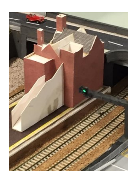
Lights on but nobody home yet

Based on Water Orton on the old Birmingham & Derby junction railway, built to watch the trains go by with a endless stream of cross-country voyagers and freight trains, plus the occasional steam special.