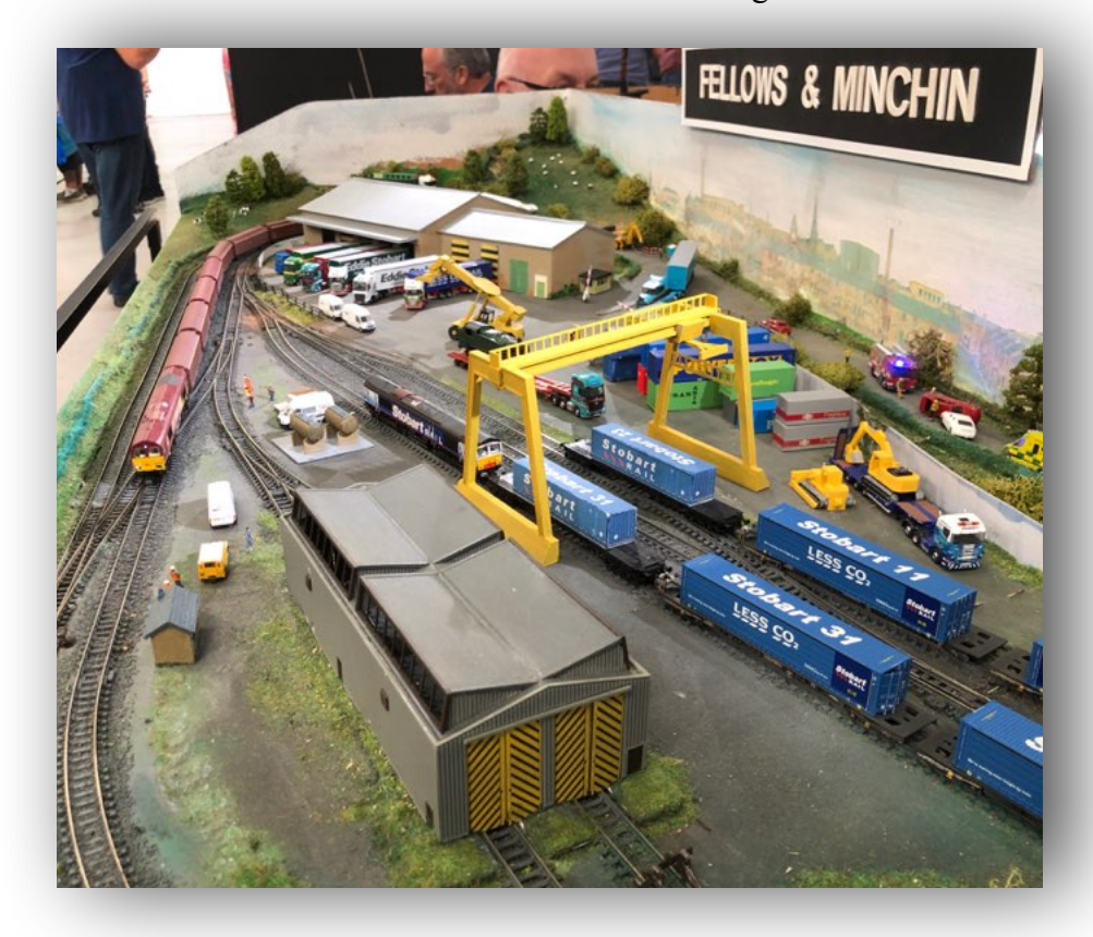
Successfully running lots of Stobart stock.

This is a freight depot based somewhere in the West Midlands and is fictitious. Created by a Fellows descendant of Fellows, Morton and Clayton who transported goods by canal all over the country in the 19th to early 20th Century based at Tipton in the West Midlands and ceased trading in 1948.