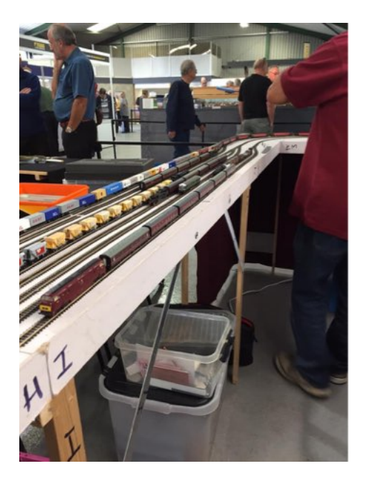
Fiddle yard filling up.......