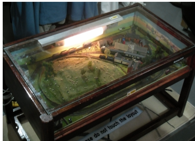
Mynoras Farm, a Ken Jones layout in a coffee table. Again at TINGS