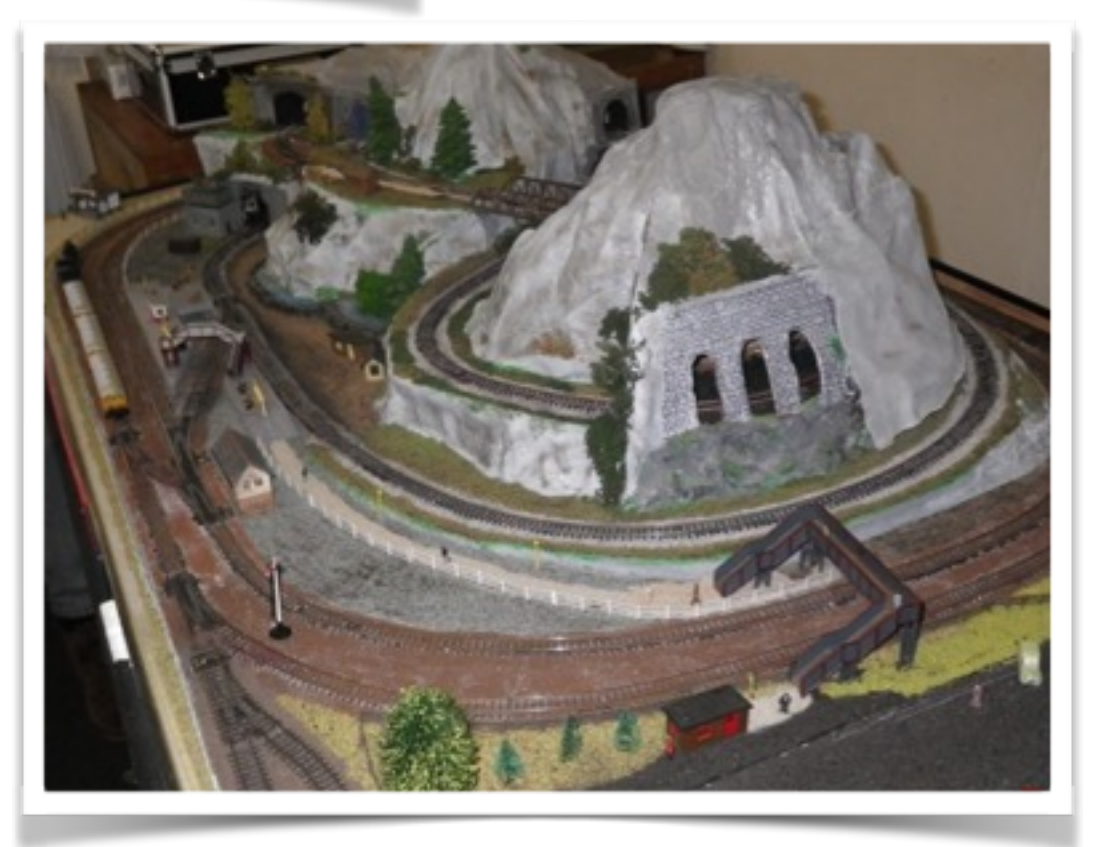
West Midlands' N' Gauge Club Newsletter Anniversary Issue 2015 Page 7 of 12

"Tipton Hills" has been accepted for the 2016 TINGS event.