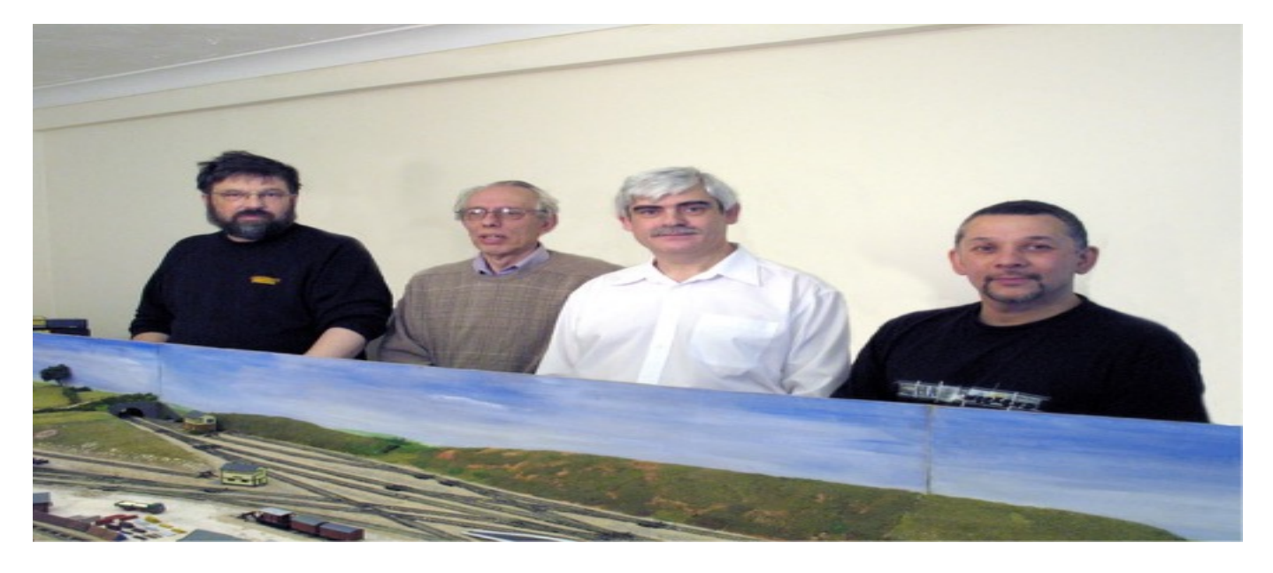
showing some of the founding members of our club.

We still have a few copies of those newsletters, which go out as hard copies for those readers who do not have an internet connection.