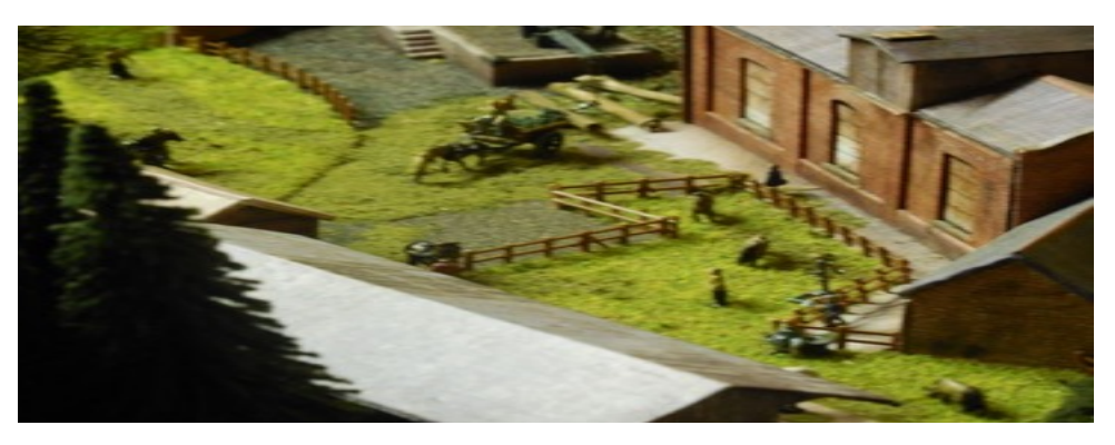
West Midlands' N' Gauge Club Newsletter Anniversary Issue 2015 Page 9 of 12