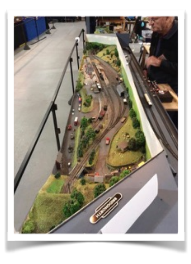
BRIDGNORTH At TINGS 2015

CHARLIEVILLE also went solo at Norwich, Bristol & Swindon.