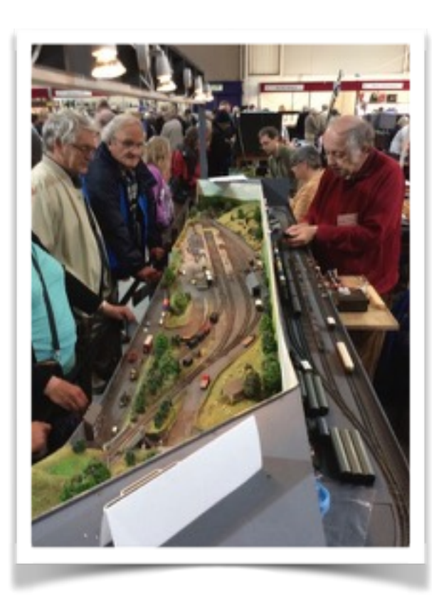
West Midlands' N' Gauge Club Newsletter Anniversary Issue 2015 Page 8 of 12