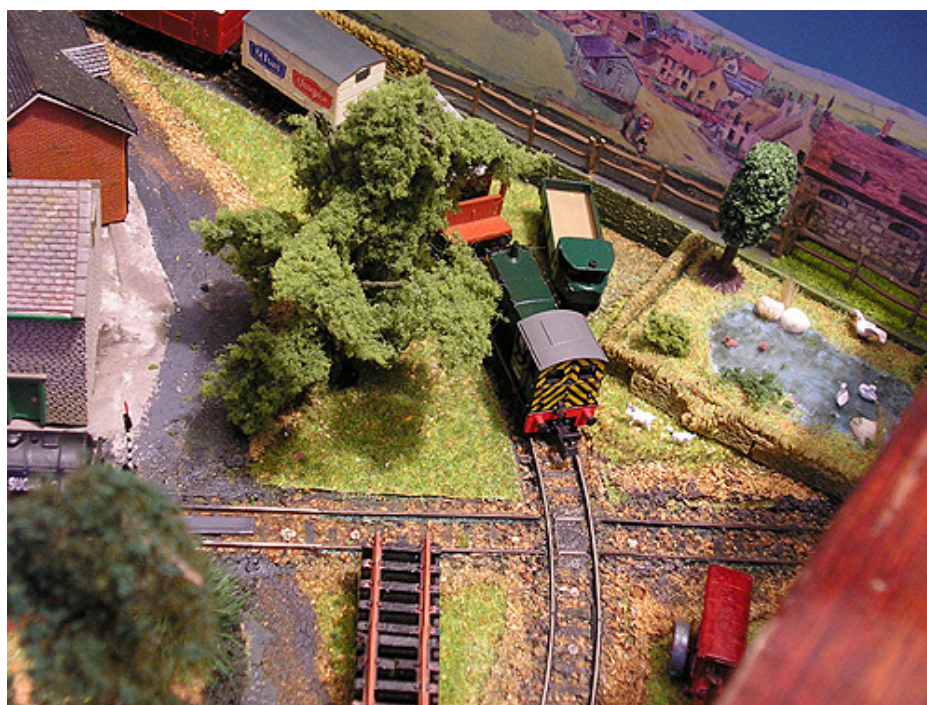
'04 and train at right angle crossing leading to planned track extension. Note the Scammell and the duck pond.