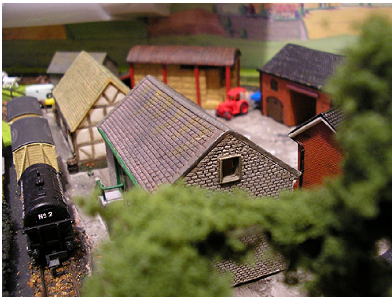
Like most farms the buildings date from a mixture of styles as the farm was extended.